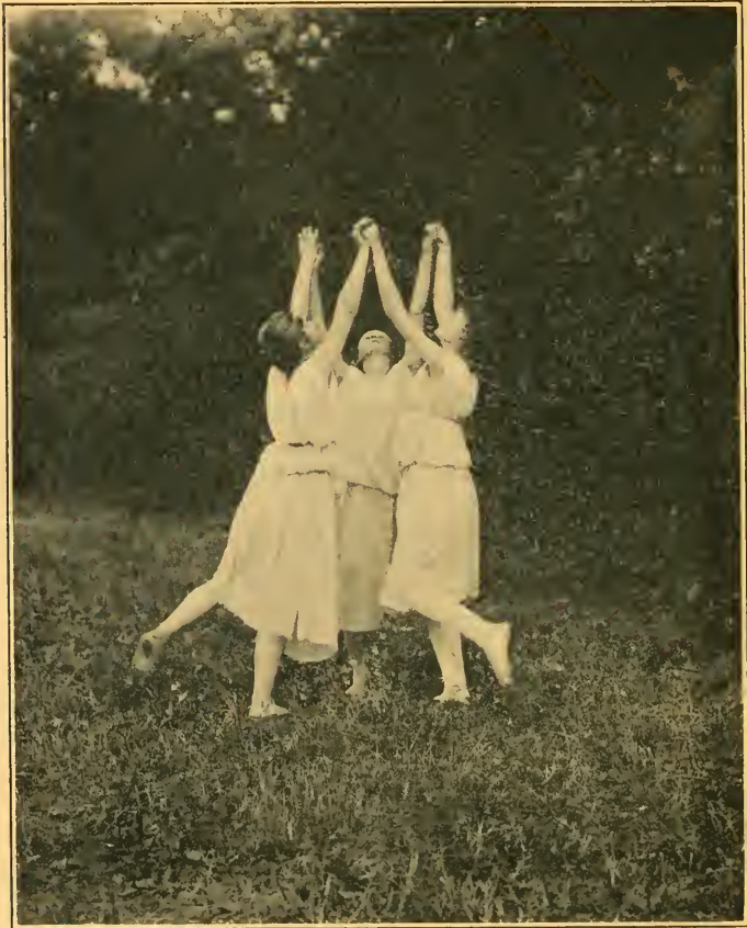
"THEN BREAK O'ER THE HILLTOPS GLAD MORNING."